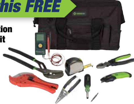
Irrigation Tool Kit