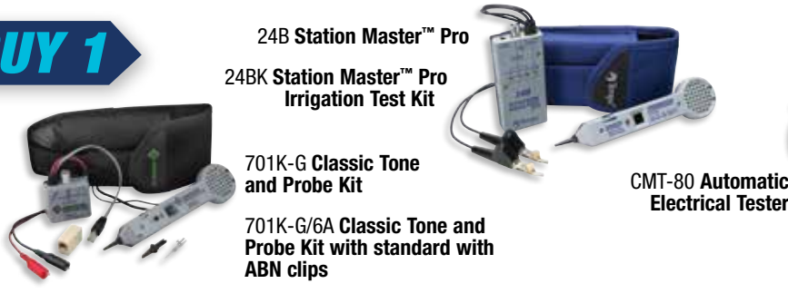
24B Station Master™ Pro