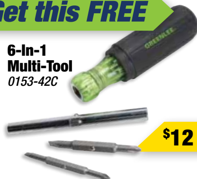
6-In-1 Multi-Tool 0153-42C