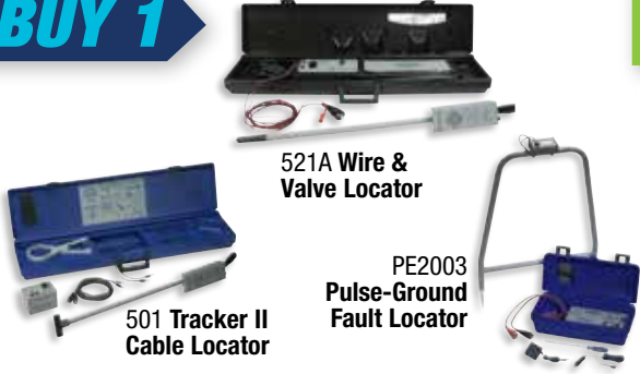
521A Wire & Valve Locator