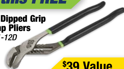
12" Dipped Grip Pump Pliers 0451-12D