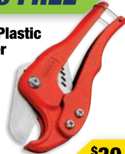
Rocut 42 Plastic Pipe Cutter 55091E