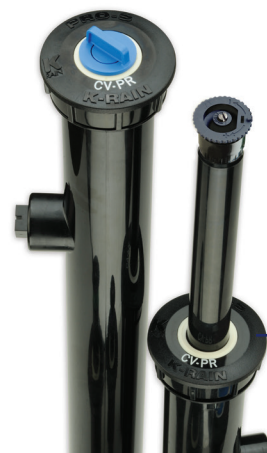
Pro-S™ 12" Sprays 6" Sprays