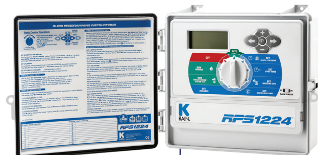
RPS® 1224 Irrigation Controller