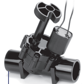
Valves Any Size, Any Type