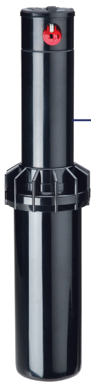
RPS® 75 Rotors

Receive a discount on every K-Rain product purchased now through September 30, 2015! Purchase $2500* of any combination of product from your favorite K-Rain distributor and receive a $250 gift card of your choice.