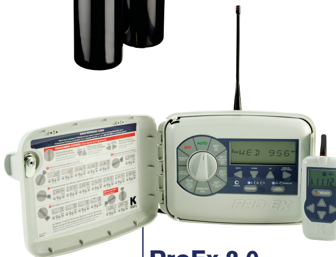
ProEx 2.0 Irrigation Controller